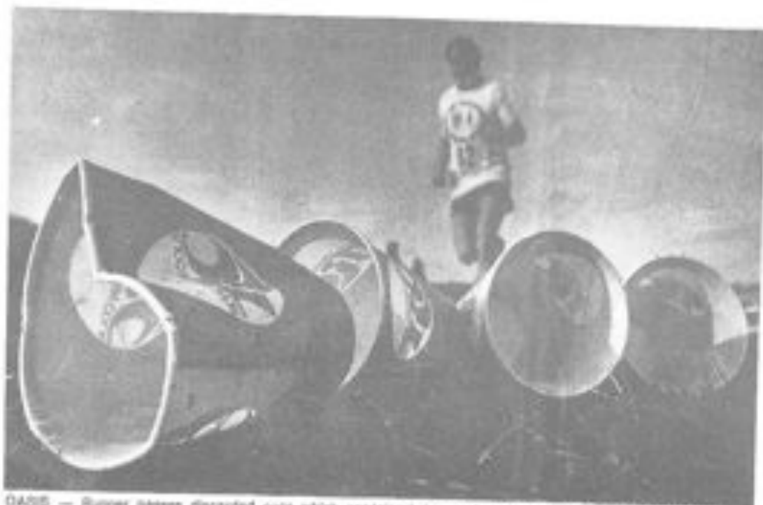
Q&A — Runner passes discarded cups which contained doses of electrolyte replacement and glucose.

The Wellesley grad is one of the fellows who has helped "make" the Five Miler big league from start to finish.