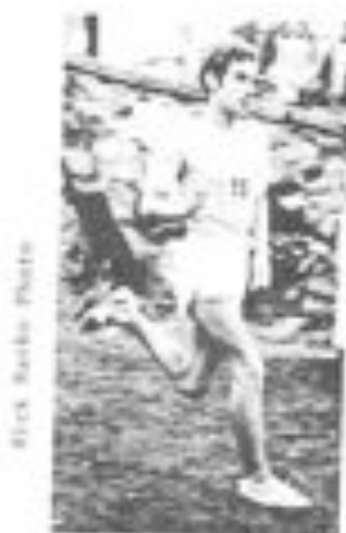
Dick Banks Photo